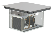
INVISI FREEZE S

GN2/1-Module Dimensions: 670x530x367 mm Power supply: 300 W Input voltage: 230 V AC