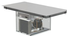
INVISI FREEZE M

GN2/1-Module Dimensions: 670x530x367 mm Power supply: 300 W Input voltage: 230 V AC